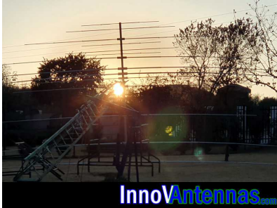
The XR7 being raised with the 3 x 4m elements clearly seen at the front