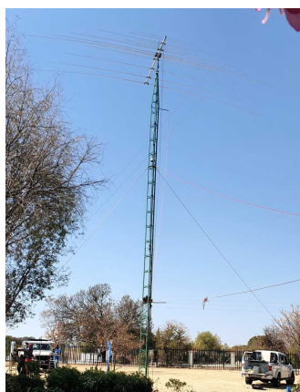
The new XR7