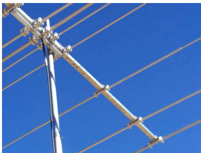
View of the 50mm (2") Square boom and element holders on the rear of the antenna