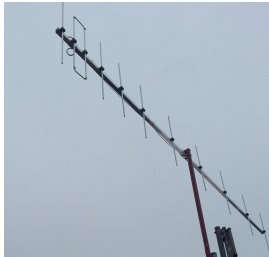
A 10 element low-noise, Professional Series AIS (162MHz) LFA Yagi - For Commercial, Professional and Marine applications