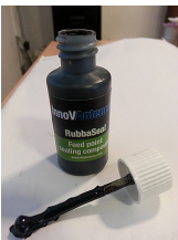
Liquid Rubber Feed Point Sealant 30ml bottle with brush-in-lid Applicator

We have formulated an excellent UV resistant rubber sealant to ensure your feed point is well protected. Unlike enclosures around the feed point which can hold in moisture, this rubber sealant is applied to both coax and terminals at the time of the antenna installation to ensure your antennas feed point remains in tip-top condition for the longest time.