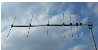
A 6 element low-noise AIS Professional Series Yagi