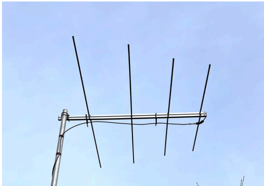
The FMDX4+ on test

A Super Wide Band, High Performance Broadcast (83-114MHz) 4 element Log Periodic Dipole Array