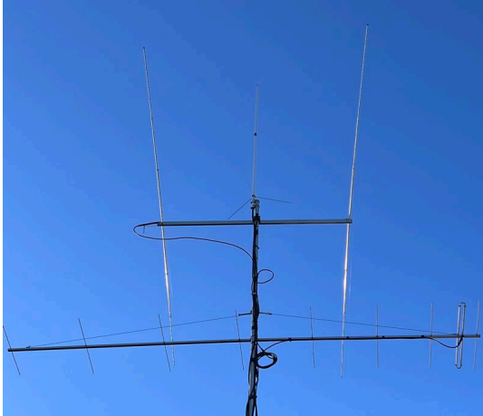
The BOLPA-2 on a tiny 2.1m boom installed and ready to go

The Twin-boom feedline of the BOLPA-2 can easily be seen in this image