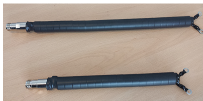
Examples of the InnovAntennas ferrite core baluns

The above shows a Yagi fed with coax and no balun at the point at which the coax is connected. The current distribution is uneven through the driven element and the coax cable can be seen to be radiating too