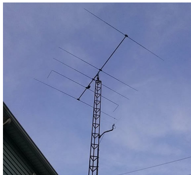
How the OP-DES looks; A 5el 10m/11m OP-DES

Manufactured the right way, not the cheapest way