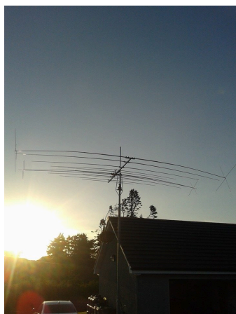
A European version of the XR6C (Compact) installed at GI0TSS (MKII with capacity loading, not yet available)