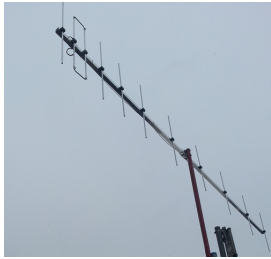
A 10 element low-noise, Professional Series AIS (162MHz) LFA Yagi - For Commercial, Professional and Marine applications