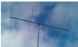
A 6 element OWL (Optimised Wideband Low Impedance) Super-Light Yagi for 69.9-70.5MHz