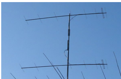
2 x 8el OWL G/T at G3YDD

Ian G0CNN made this excellent video which highlights how simple the OWL is to construct: