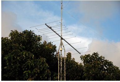
A 11el 88-108 OP-DES