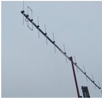
A 10 element low-noise, high gain AIS Professional Series Yagi