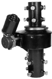
Model: SPID RAK