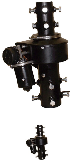
Heavy duty Azimuth Rotator