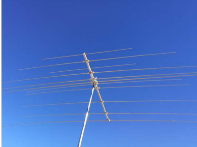
The new XR6 MkII being tested at our factory

Average Gain per band @ 20m above average ground: 11.24dBi