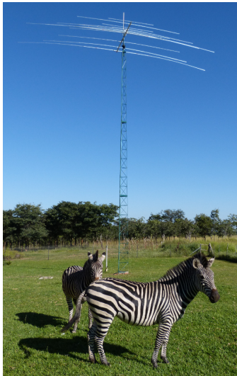
XR6 Mk1 version, installed at 9J2MM