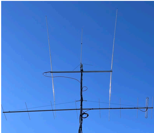
The BOLPA-2 on a tiny 2.1m boom installed and ready to go

The Twin-boom feedline of the BOLPA-2 can easily be seen in this image