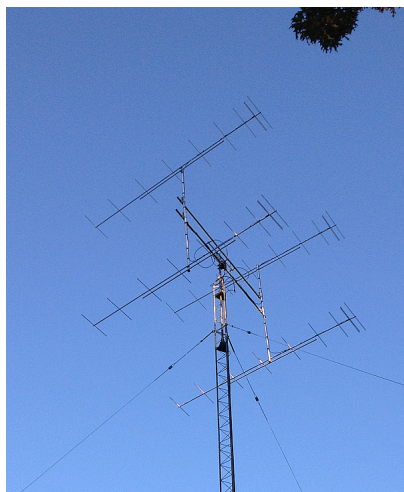
4 x 9el OWL- G/T at K7BV

Manufactured the right way, not the cheapest way!