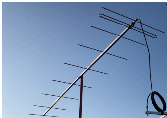
One of 4 9el OWL G/Ts @ WB0O