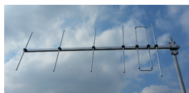
A 6 element low-noise, Professional Series AIS (162MHz) LFA Yagi - For Commercial, Professional and Marine applications

Available through WiMo Germany and DX Engineering in the USA - for Direct factory supply, Email us for pricing and time lines.