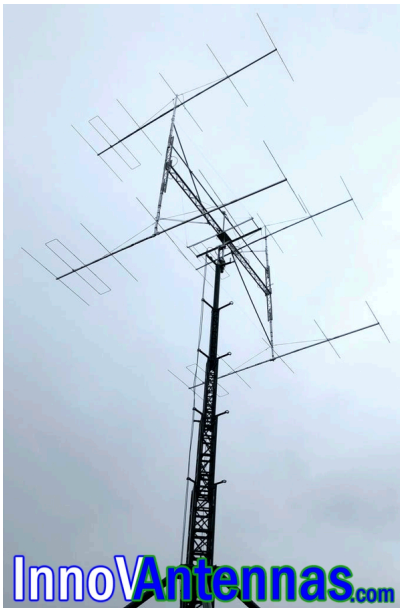
4 x 6el LFA-3 on 8.2m boom at TF3ML

If you require a full stacked system, InnoVAntennas can supply all cable, H-frames and everything you need for a turnkey solution. Contact sales 'at' innovantennas.com