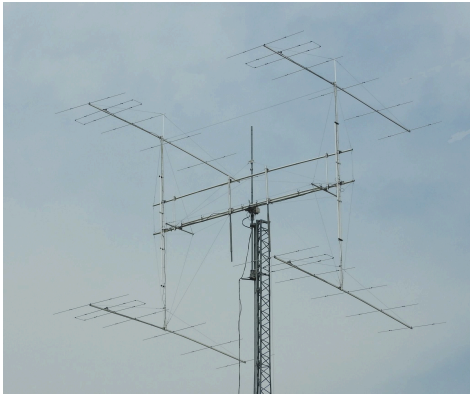
4 x 6el LFA-3 for 50MHz @ JA7QVI