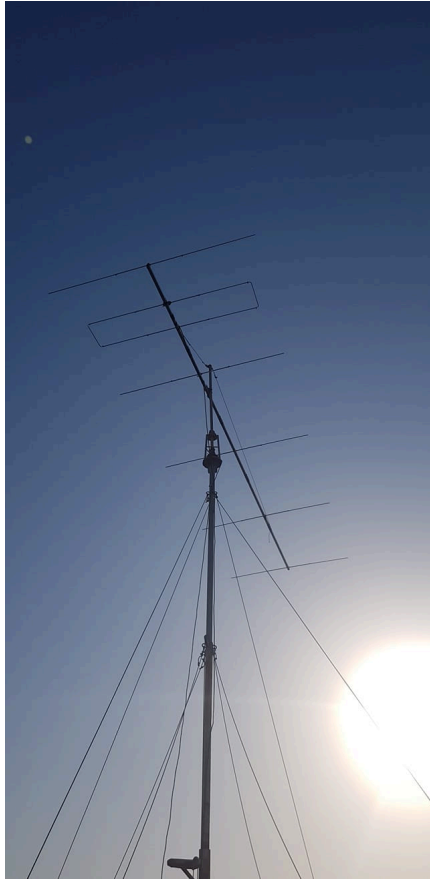
A low-noise 6 element 50MHz LFA-3 third generation G0KSC Yagi