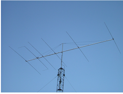
A Wideband 6 element 27Mhz & 28MHz Dual-Band OP-DES Yagi 8.5m boom