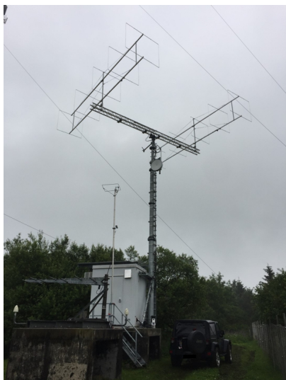
A low noise high gain 5el 50MHz LFA-Q Directional Loop Array