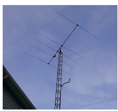
How the OP-DES looks; A 5el 10m/11m OP-DES