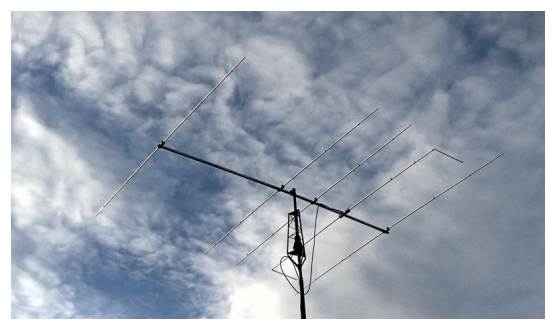
The 5el OP-DES covering all of 10m (28MHz to 30MHz) @ 2E1RDX

Customer Build video showing construction HERE: