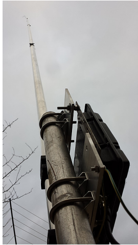
A Heavy Duty, Self supporting vertical HF antenna for HF 43' long. 60m/40m/30m/20m/17m Band vertical HF antenna