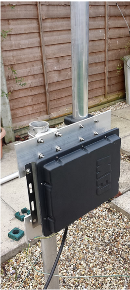
A typical installation with MFJ tuner installed with optional ATU mount fitted (VertiGo 43V pictured)