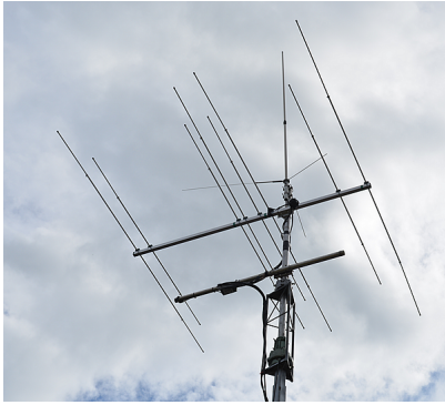
A Dualband 50/70MHz Yagi with single feedpoint - 2017 version