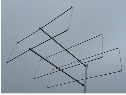
A 3 element rear mount 70MHz LFA-Q