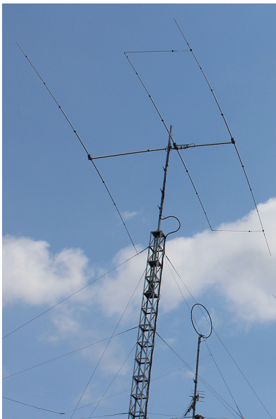
3el 20M OP-DES installed in 'JA'

Two figurations below, high F/B version or high Gain version: