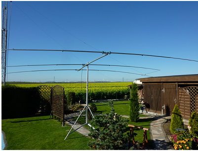
3el OP-DES for 14MHz ready to install at DL5ME