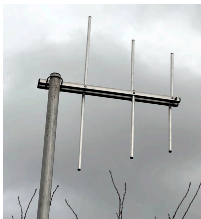
The DABDX ready for Testing

A Super Wide Band, High Performance DAB DX (178-235MHz) 3 element Log Periodic Dipole Array