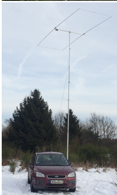
15m InnovAntennas Moxon in user portable