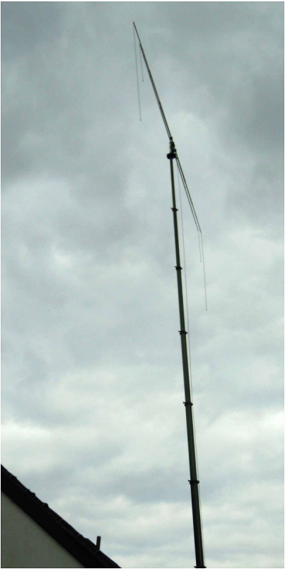
Manufactured the right way, not the cheapest way //