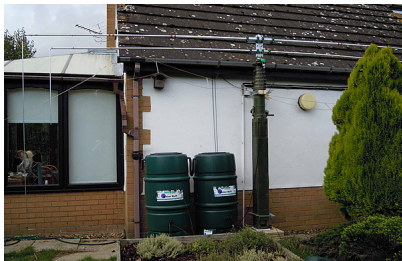
2 band 20/17 DESpole pictured

More information on how the DES-dipole is better than the rest can be found HERE