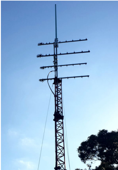
4 x 11el 477MHz LFA Yagi installed at one of our Oz customers