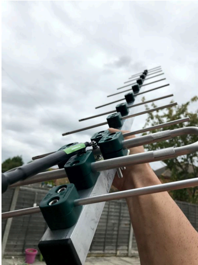
A 11 element low-noise 477MHz LFA Yagi