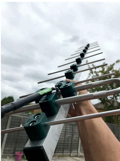
Looking down the barrel of the 11el 477MHz LFA Yagi