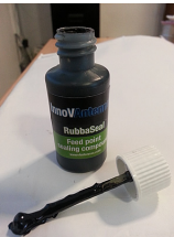
Liquid Rubber Feed Point Sealant 30ml bottle with brush-in-lid Applicator

We have formulated an excellent UV resistant rubber sealant to ensure your feed point is well protected. Unlike enclosures around the feed point which can hold in moisture, this rubber sealant is applied to both coax and terminals at the time of the antenna installation to ensure your antennas feed point remains in tip-top condition for the longest time.