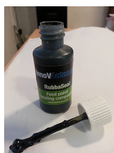
Liquid Rubber Feed Point Sealant 30ml bottle with brush-in-lid Applicator

We have formulated an excellent UV resistant rubber sealant to ensure your feed point is well protected. Unlike enclosures around the feed point which can hold in moisture, this rubber sealant is applied to both coax and terminals at the time of the antenna installation to ensure your antennas feed point remains in tip-top condition for the longest time.