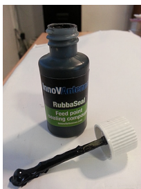
Liquid Rubber Feed Point Sealant