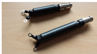
70cms and 2m baluns pictured above

The above shows a Yagi fed with coax and no balun at the point at which the coax is connected. The current distribution is uneven through the driven element and the coax cable can be seen to be radiating too